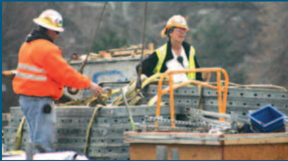
Construction crews at work on the site of The New Wishard.